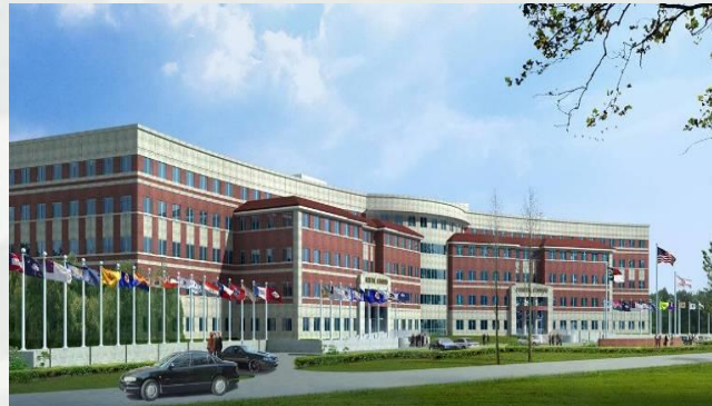
FORSCOM Headquarters Fort Bragg Cost: $300M