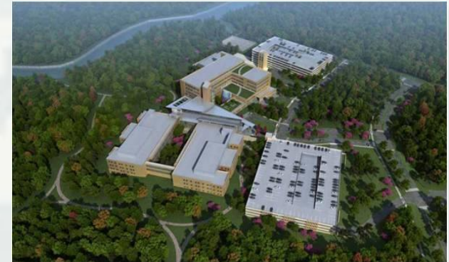
Hospital Fort Benning Cost: $375M