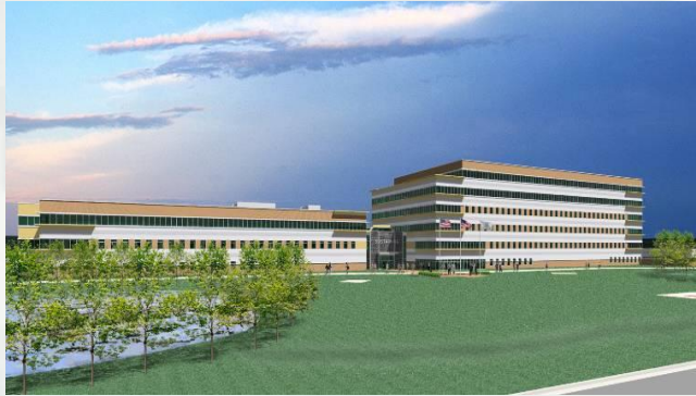
AMC Headquarters Redstone Arsenal PA: $127M